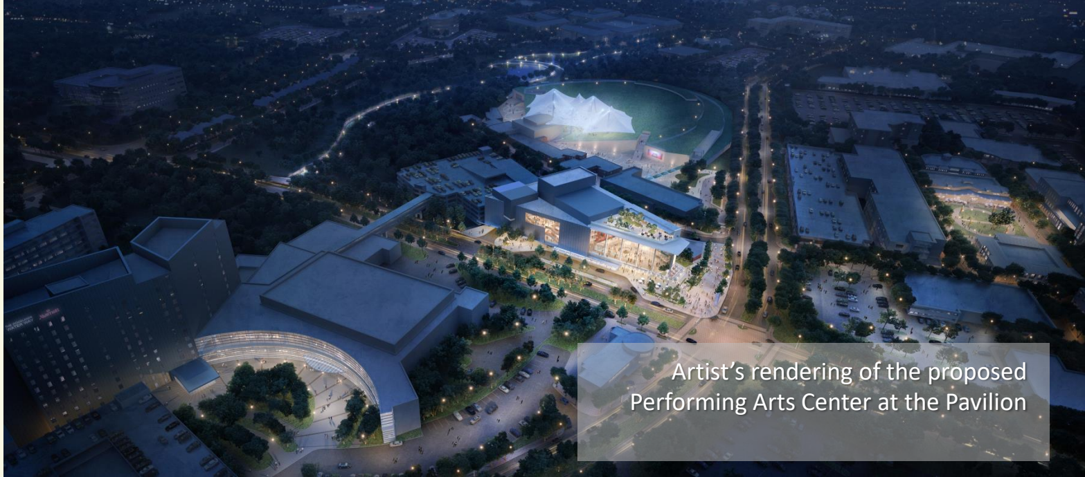
Artist's rendering of the proposed Performing Arts Center at the Pavilion