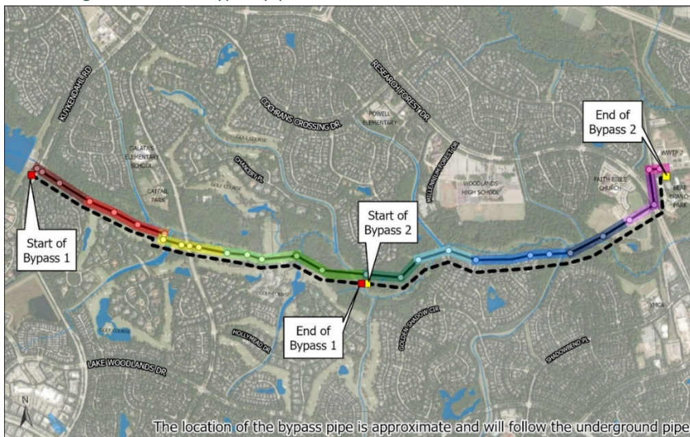
Estimated Construction Schedule for Each Repair Segment (subject to change pending weather conditions)

In June SAK started the cured-in-place pipe (CIPP) lining process as well as the manhole rehabilitation efforts. By using CIPP, SJRA will be able to significantly increase the life of our aging gravity sewer system in the most cost-effective manner that also reduces the construction schedule and impacts to the community. The CIPP process is being completed in smaller segments as shown below and during these operations SAK will be onsite 24 hours per day, 7 days a week. Once the first half of the segments are rehabilitated, SAK will relocate the bypass to then start the second half of the project. Below is a map that identifies each segment, the two bypass pipelines, and the estimated construction schedule.